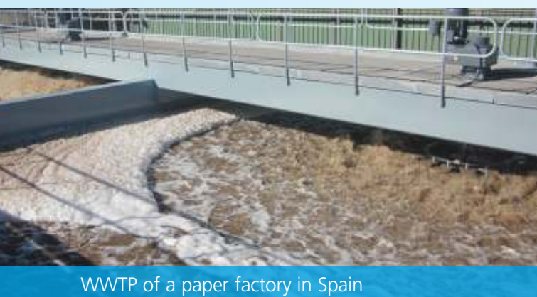
WWTP of a paper factory in Spain

BSK® surface aerators are available with different diameters for adjustable O 2 input capacities (see table) according to specific project conditions.