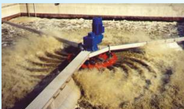
Floating BSK®-Turbine (WWTP Krzyz, Poland)

It is well known, that the aeration system of a wastewater treatment plant is the largest power consumer on site. Consequently, it is important to reduce the energy consumption to the lowest possible level. As a result, the efficiency of aeration systems is an important matter concerning the long-term energy balance. BSK®-Turbines play an important part in fulfilling this objective.