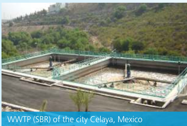
WWTP (SBR) of the city Celaya, Mexico

Depending on the individual application, BSK®-Turbines can be operated as fixed or floating systems. We offer different shapes for the floating construction to suit site specific requirements. The floating turbines are preferably used in combination with the SBR process.