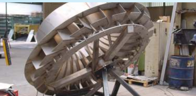
BSK®-Turbine Ø 2,500 mm (production phase)

specific project requirements and operation conditions. Thus, we offer our utmost support to customers and consultants with respect to an optimized correspondence of BSK® equipment and the design of aeration tanks, sludge stabilization reactors, buffer-tanks and similar applications.