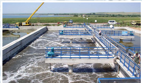
SB-reactor during aeration phase