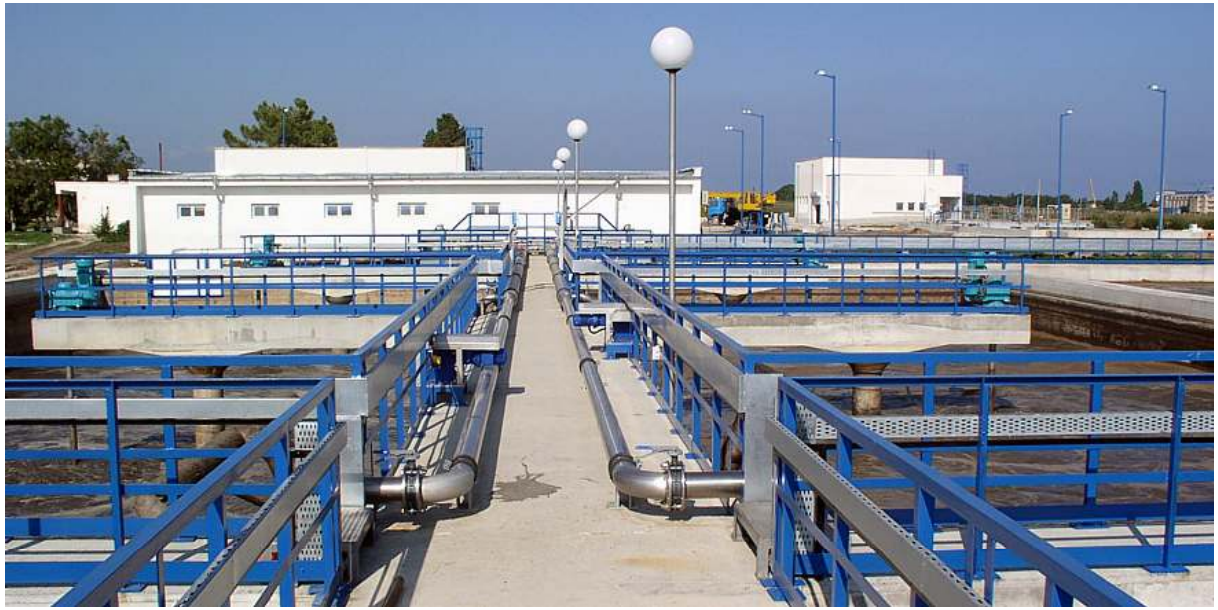
View from the service platform to the two SB-reactors