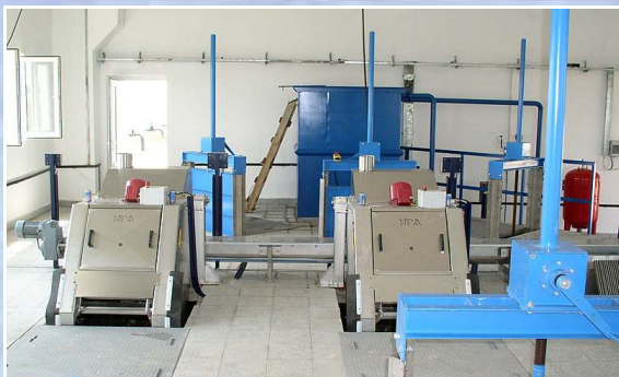
2-street screening system located in the operation building