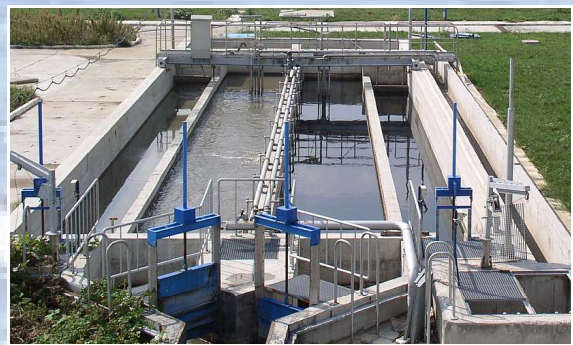
Inlet of the WWTP with valve and sand trap