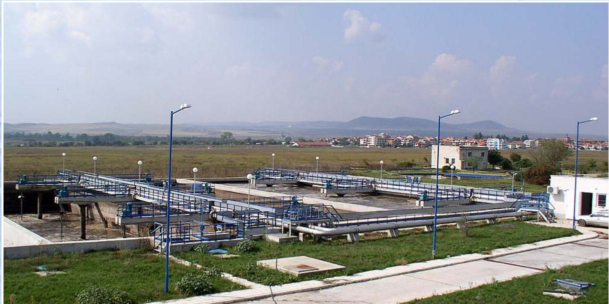
View of the 4-street SBR-WWTP of the resort SUNNY BEACH