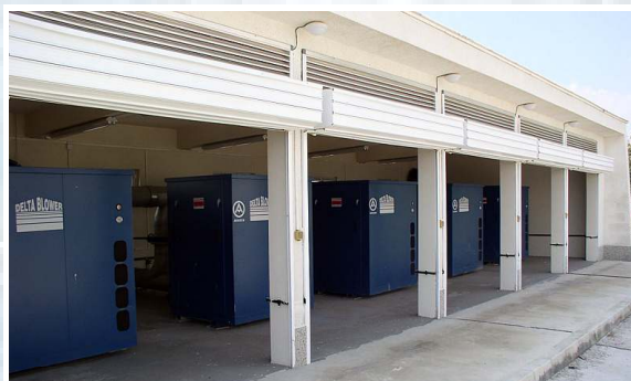
Station with 5 rotary blowers