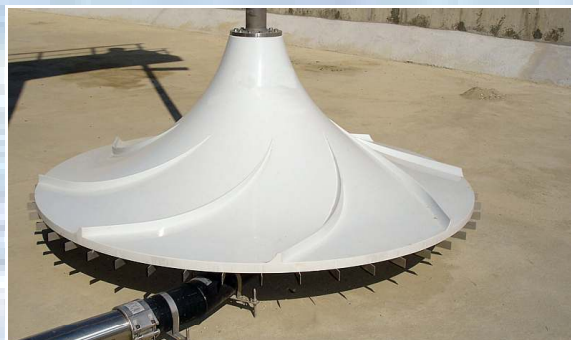
Detailed view of a mixing and aeration system