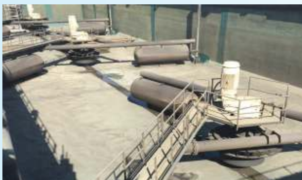
BSK®-Turbines Ø 2,500 mm, United Arab Emirates

Depending on the individual application, BSK®-Turbines can be operated as fixed or floating systems. We offer different shapes for the floating construction to suit site specific requirements. The floating turbines are preferably used in combination with the SBR process.