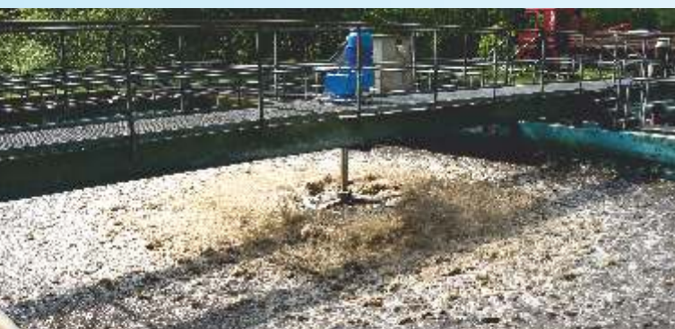
Replacement of old aerators by BSK®-Turbines Ø 1,250 mm

BSK® surface aerators are available with different diameters for adjustable O 2 input capacities (standard values: see table) according to specific project conditions.