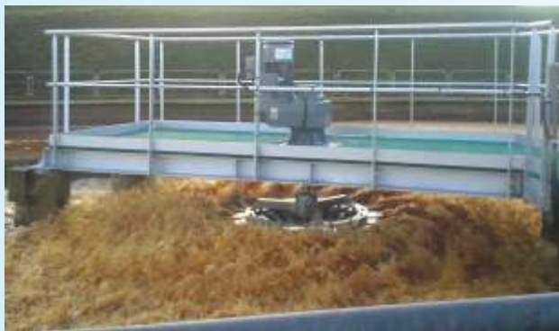
BSK®-Turbine Ø 1.400 mm, Cheese factory, France

The latest generation of BSK® surface aerators (turbines) guarantees an outstanding oxygen transfer in aeration tanks – combined with intensive mixing of the reactor’s contents. One of the significant characteristics of the BSK® surface aerator is its similarity to the famous Francis-water turbine, an outstanding component of hydropower stations, guaranteeing highest efficiency rates. Clearly, the BSK®-Turbine offers a comparable performance level.